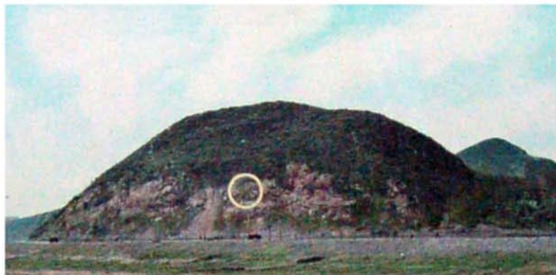
The panoramic view of the Komunmoru Remains.

That the descendants of the Komunmoru people lived from generation to generation in the Taedong River basin centering on the Pyongyang area is to be proved well by remains belonging to the middle Palaeolithic era, including those found in Taehyondong, Ryokpho District, Pyongyang, and the lower layer of a cave in Mt. Sungni in Tokchon City, South Phyongan Province, and remains ascribed to the late Palaeolithic era, including those in a cave at Mandal-ri, Sungho District, North Hwanghae Province, and the middle layer of a cave in Mt. Sungni in Tokchon City, ►