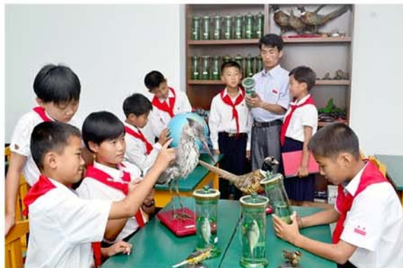
Children at their studies.

► held in Haimen City, Jiangsu Province, China, in March 2014, a year after it opened. The Democratic People's Republic of Korea, China, Thailand, Japan and south Korea participated and they played league matches. The victory and defeat were concluded by the total number of scores. The DPRK team had no experience in international games, so those matches were really hard