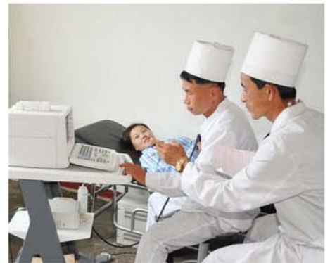
Doctors discuss on effects of Koryo treatment.