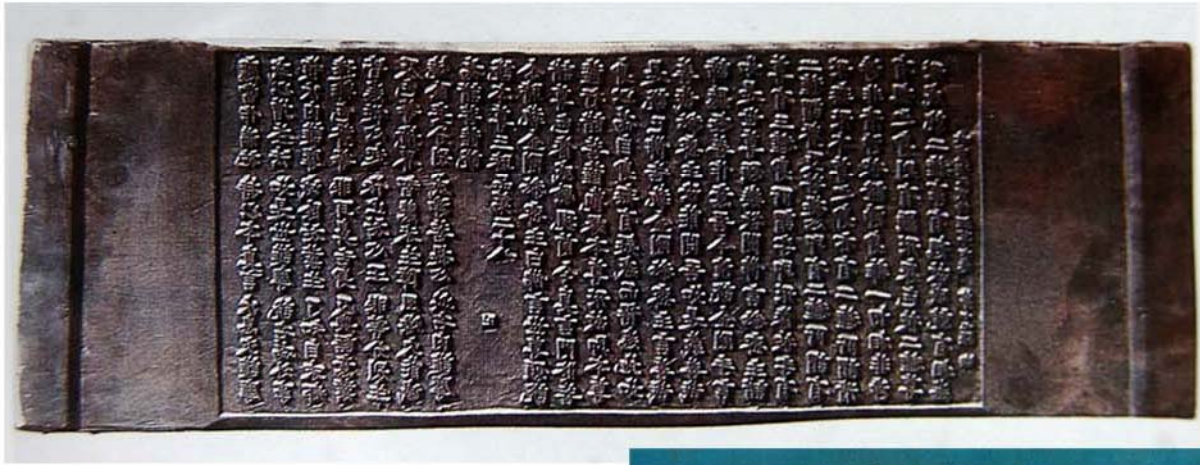
A wooden block of The 80 000 Blocks of the Complete Collection of Buddhist Scriptures and a book printed with the blocks.

I N KOREA THERE ARE OLD BOOKS printed with 80 000 blocks. They are the Complete Collection of Buddhist Scriptures which were compiled during the Koryo dynasty (918–1392). They are a library of Buddhist literature comprising a colossal amount of books in classification. The engraving of the blocks began in 1011 and ended in 1087, and the scriptures consist of over 6 000 volumes.