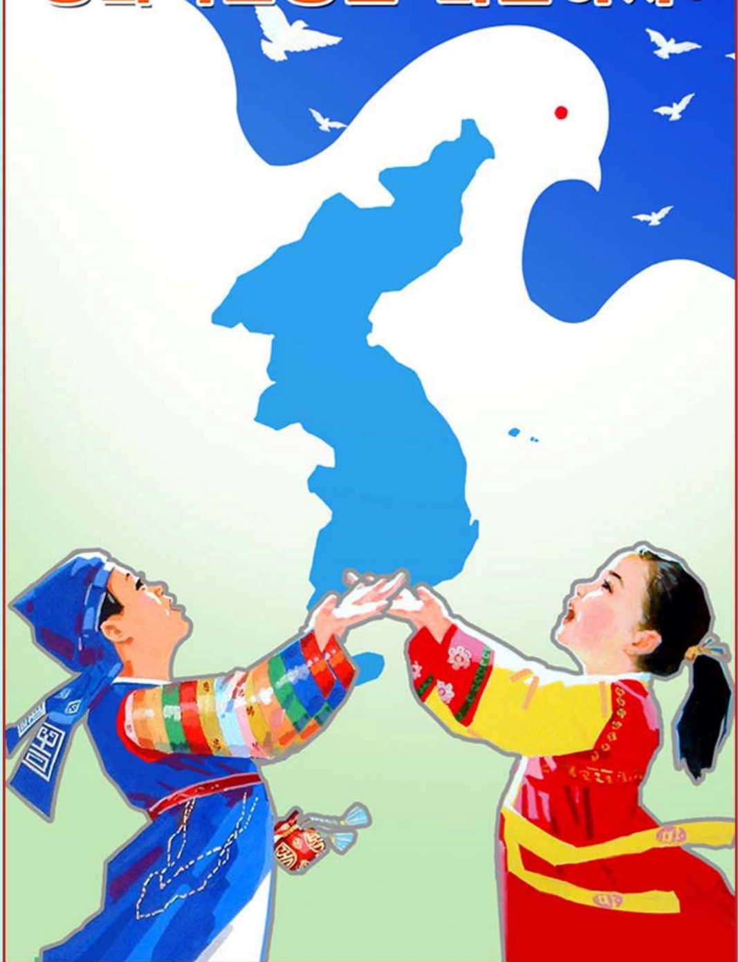
Poster "Let's create a peaceful environment!"