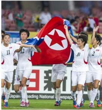
Front Cover: All-time winners of the EAFF Women's East Asian Cup 2015