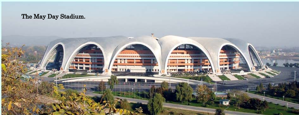
The May Day Stadium.

S INCE 2012, THE FIRST year of the new century of the Juche era, the Democratic People's Republic of Korea has newly built a large number of sports facilities and refashioned existing ones all over the country amidst the growing public interest in and enthusiasm for sports. Such projects are still going on.