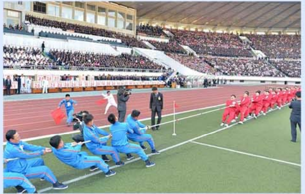
The national inter-provincial games take place annually with splendour.