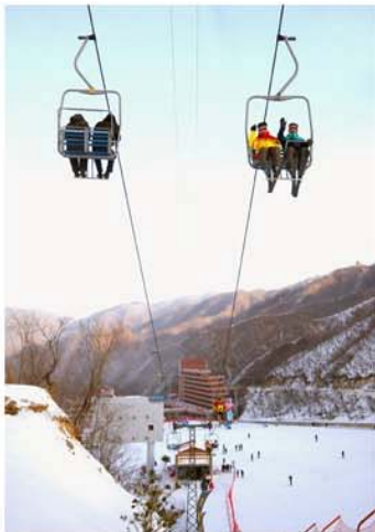
Back Cover: Chair lifts in the Masikryong Ski Resort