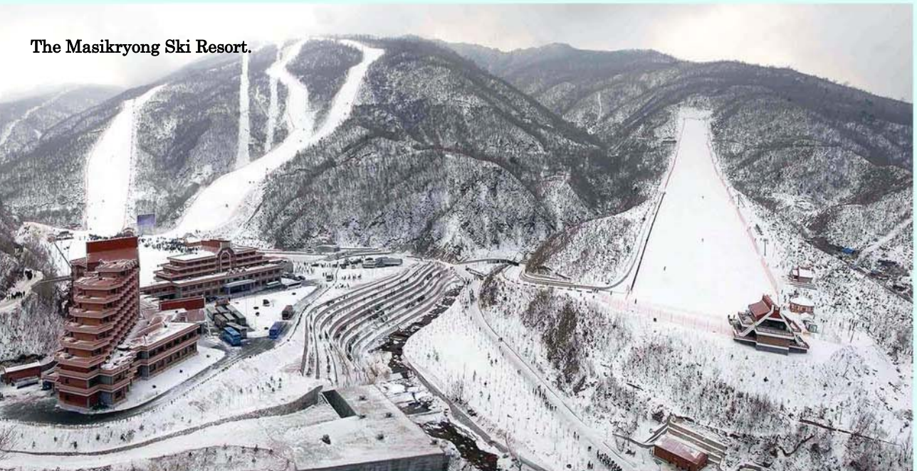
The Masikryong Ski Resort.

In a scenic mountain area of Masik Pass, a ski resort was laid as a comprehensive winter sports base that has a full condition for ►