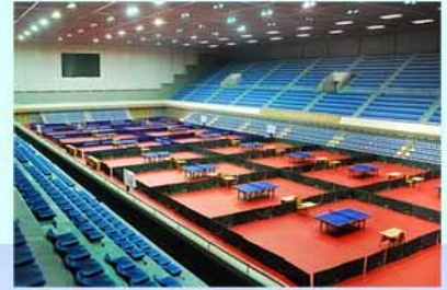
Parts of the interior and exterior of the stadiums in the Sports Village on the Chongchun Street.