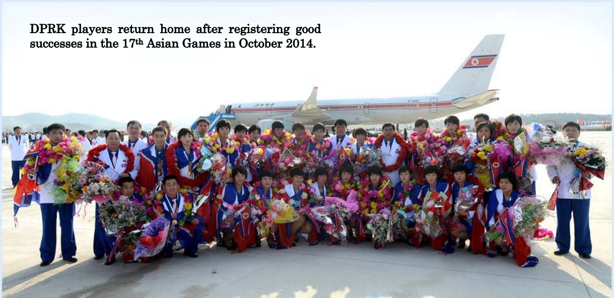
DPRK players return home after registering good successes in the 17 th Asian Games in October 2014.

To raise the odds-on sports events to the global standards and put other events, including defence sports, water sports and winter sports, on a par so as to win more Asian titles and further more world titles in more events—this is the orientation the