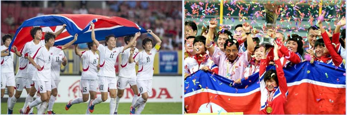
The DPRK women footballers take first place in the EAFF Women's East Asian Cup 2015.

I N RECENT YEARS THE DEMOCRATIC People's Republic of Korea has gained lots of achievements at international games as a result of quick progress in the sports field. Over the last four years the Korean sportspeople have won more than 1 050 medals, including some 460 gold medals, in nearly 260 international competitions, especially at the 30 th Olympic Games, the 17 th Asian Games and the 18 th Taekwon-Do World Championships.