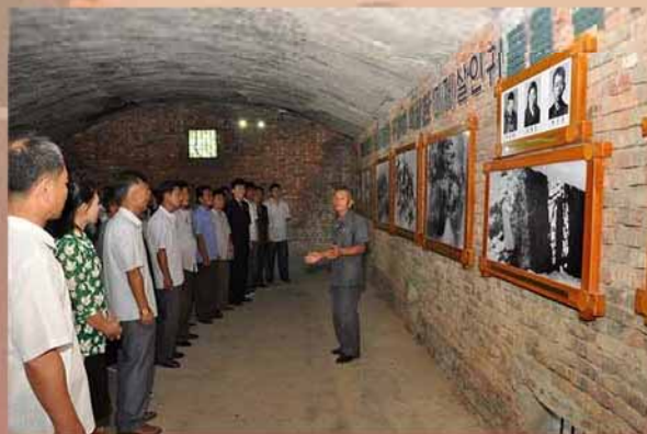
▶ A powder magazine in the Pamnamu-gol.