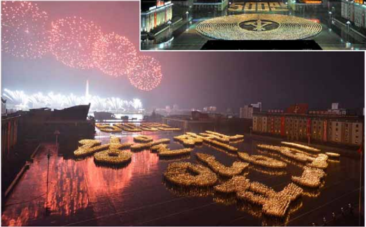
A scene from the 10 000-peopled artistic performance “The Great Party and the Bright Korea” in celebration of the 70 th anniversary of the Workers’ Party of Korea.