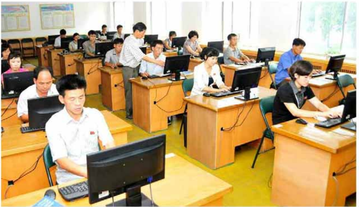
Workers improve their technical and skill levels in the sci-tech diffusion room.

the quality of products and modernization of the production processes. When manufacturing a tube train in September last, they solved many technical problems. And they are playing an active role in realizing CNC and unmanned operation in all production processes such as material supply, sheet metal processing,