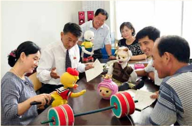
Artists are engrossed in creation of a new play.

▶ Meanwhile, the actors, who are in their 20s or 40s and 50s, are devoting all their energies to the improvement of their performing level. Sometimes they play the role of children, and sometimes that of covetous land-