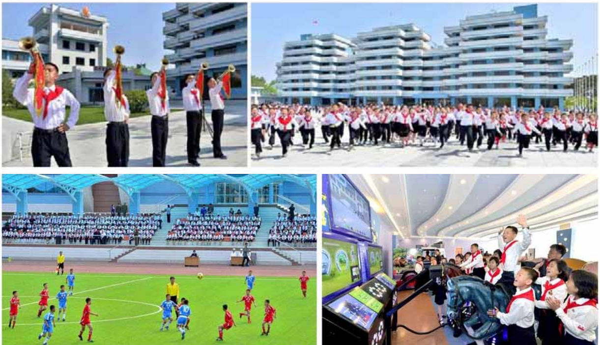
Schoolchildren enjoy themselves at the Songdown International Children's Camp.

The state is concerned for the education of the rising generation. In the ardour of educational revolution in the new century, the work of turning all people well versed in science and technology is accelerated at full speed. With the introduction of the universal 12-year compulsory education, more schools are built and educational institutions are furnished sufficiently with experimental apparatuses and teaching tools. Along with this, emphasis is placed on the improvement of the contents and methods of education at normal and teacher-training colleges and the training of more reserve teachers. Science & technology dissemination rooms are opened at factories, enterprises and cooperative farms all over the country, and the