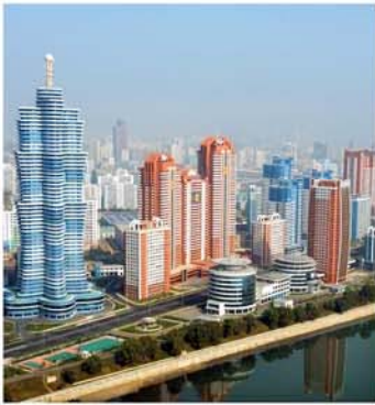
Front Cover: The Mirae Scientists Street