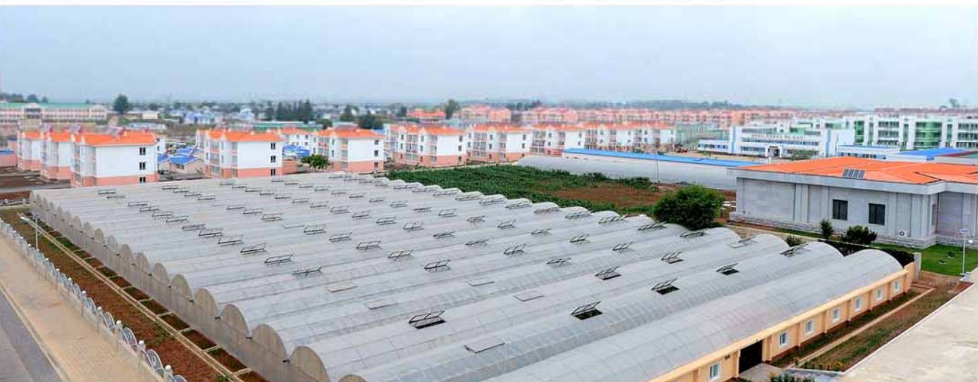
The Jangchon Vegetable Cooperative Farm, Sadong District, Pyongyang.