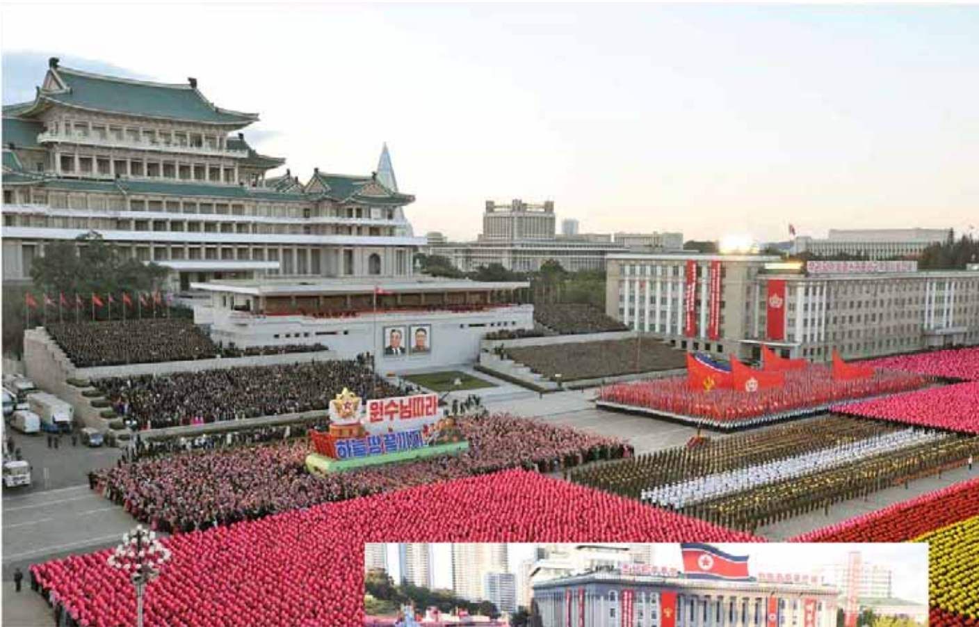
Scenes from the military parade and Pyongyang citizens' mass demonstration in celebration of the 70 th anniversary of the Workers' Party of Korea.