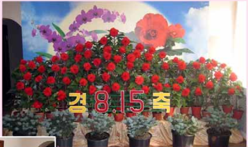
A picture of a Kimjongilia exhibition in Nakhodka, Russia.