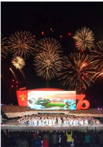
Back Cover: A scene from the 10 000-peopled artistic per- formance “The Great Party and the Bright Korea” in ce- lebration of the 70 th anniversary of the Workers’ Party of Korea