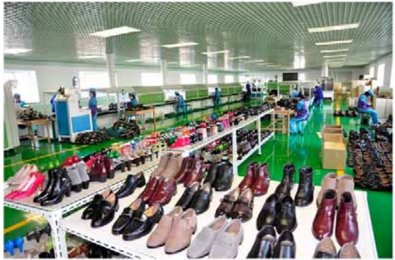
The Wonsan Leather Shoes Factory.

In Korea a noble view of life and moral sense has become an admirable habit of the people who find true worth of life in devoted efforts for the motherland and people, for the comrades and the collective. When the spirit of helping and leading one another forward is exalted in society, there has appeared a “maiden mother,” 20, who has taken in and is bringing up many orphaned children, and a woman doctor who has cured an ordinary girl of her impaired face after eight years of torment. Their good conducts have been widely known across the country, stirring the hearts of all people. So many girls have