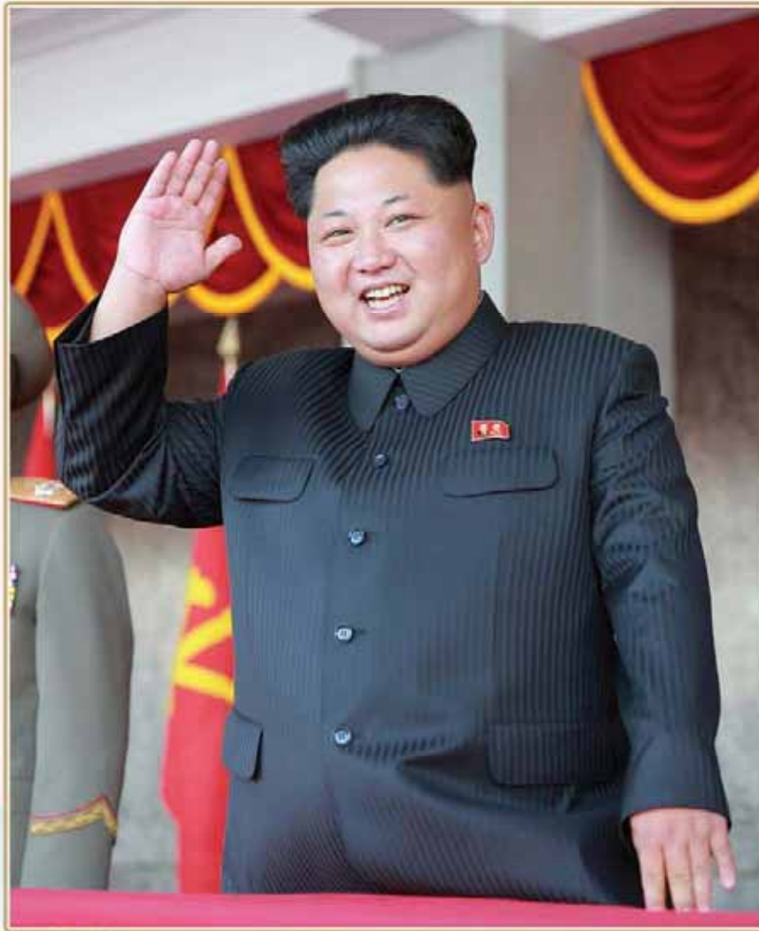
The national leader Kim Jong Un attends the military parade and Pyongyang citizens' mass demonstration in celebration of the 70 th founding anniversary of the Workers' Party of Korea in October 2015.