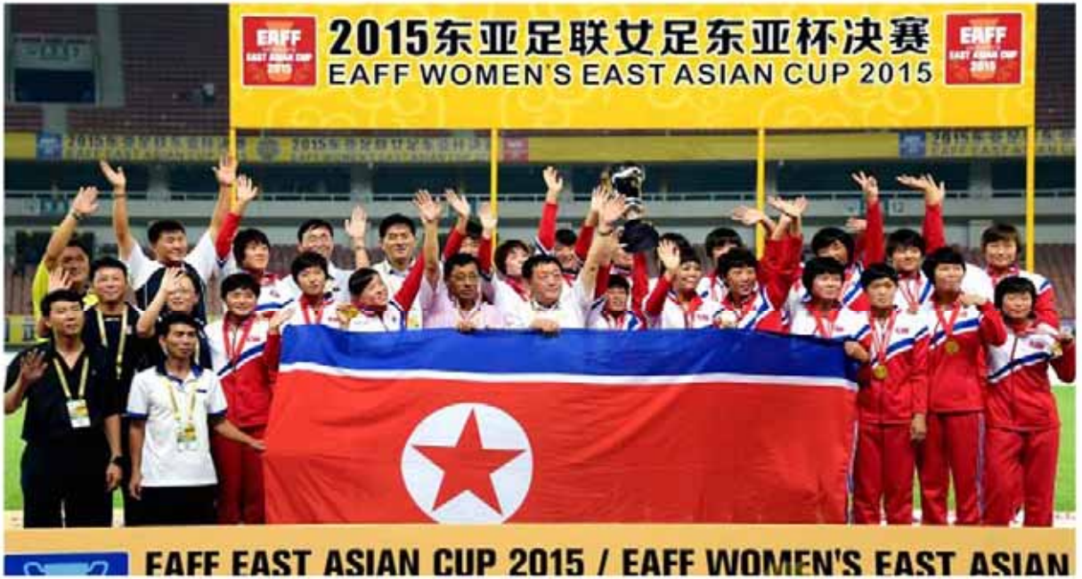
The DPRK footballers win the EAFF Women's East Asian Cup 2015.

▶ working people are studying hard at distance-learning colleges. The modern Sci-tech Complex has gone up magnificently on beautiful Ssuk Islet in the Taedong River. Apartment houses for the teachers of Kim Il Sung University and the Kim Chaek University of Technology, Unha Scientists Street, Wisong Scientists Residential District, Mirae Scientists Street and Yonphung Scientists Holiday Camp have been built, so that educators and scientists may devote themselves to their work free