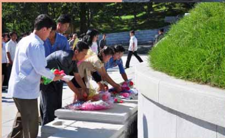
Visitors honour the memory of the murdered at the Tomb of 400 Mothers and the Tomb of 102 Children.

T HE SINCHON MUSEUM was rebuilt recently. It is a historic place bearing witness to atrocities of the US imperialist aggressors who murdered the innocent Korean people when they temporarily occupied the northern half of Korea during the Korean war (June 1950–July 1953) they had started.