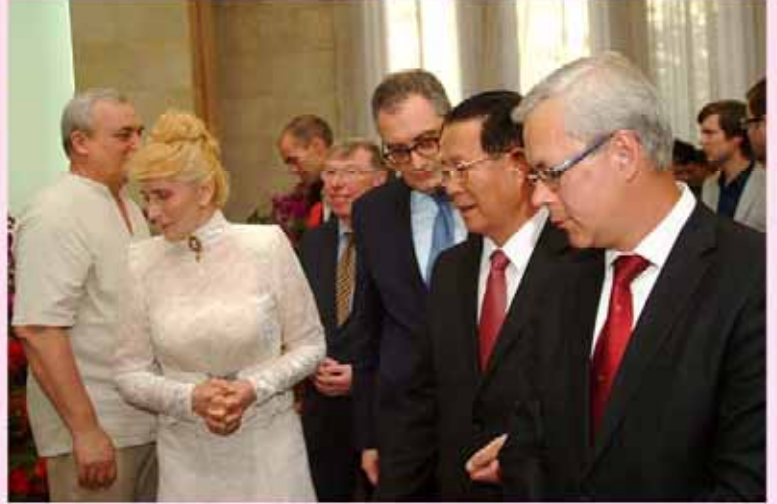
A Kimilsungia-Kimjongilia exhibition opens in Moscow.

I N AUGUST LAST exhibitions of Kimilsungia and Kimjongilia, the immortal flowers of Korea, were held in Moscow and Nakhodka, Russia on the occasion of the 70 th anniversary of Korea's liberation. They were