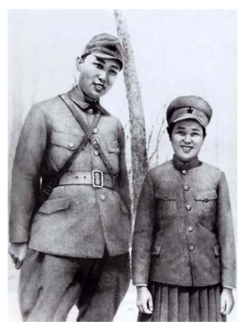
Kim Jong Suk posing with Kim Il Sung in the days of the anti-Japanese armed struggle