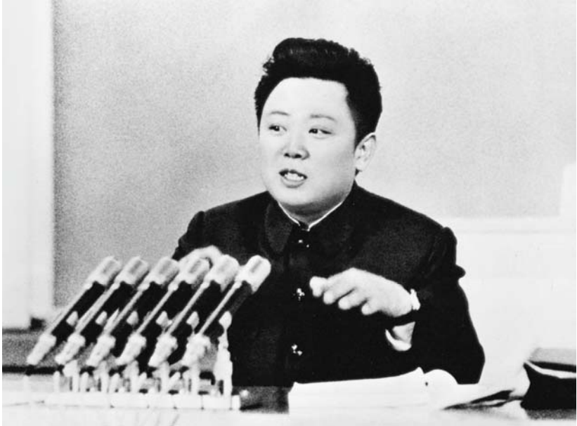
Kim Jong Il concluding the National Training Course for Party Information Workers (February 19, 1974)