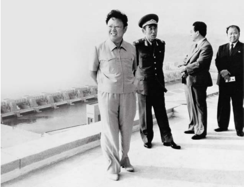
Kim Jong Il inspecting the West Sea Barrage (June 23, 1986)