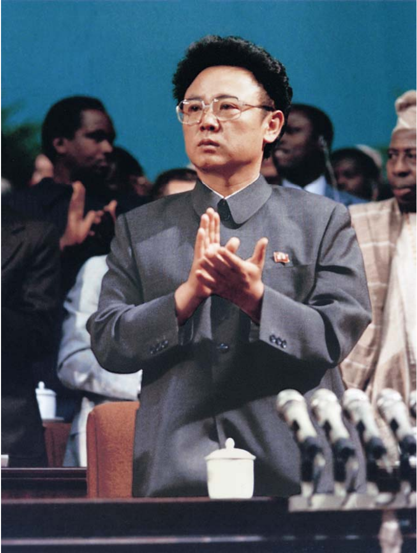
Kim Jong Il attending the Sixth Congress of the WPK (October 10, 1980)