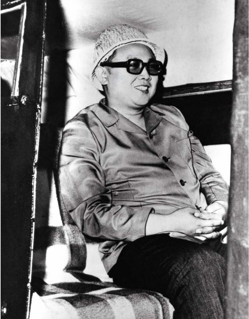
Kim Jong Il giving on-the-spot guidance at the Komdok Mine (July 1, 1975)