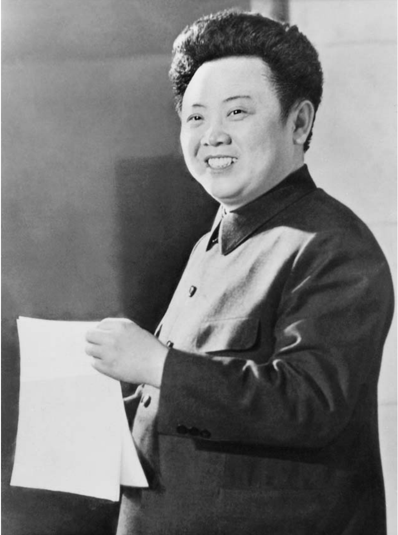
Kim Jong Il going over documents related to Party work