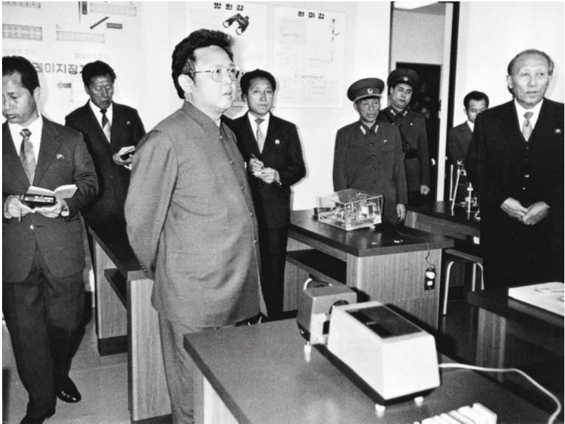
Kim Jong Il looking round the Pyongyang Senior Middle School No. 1 (February 26, 1985)