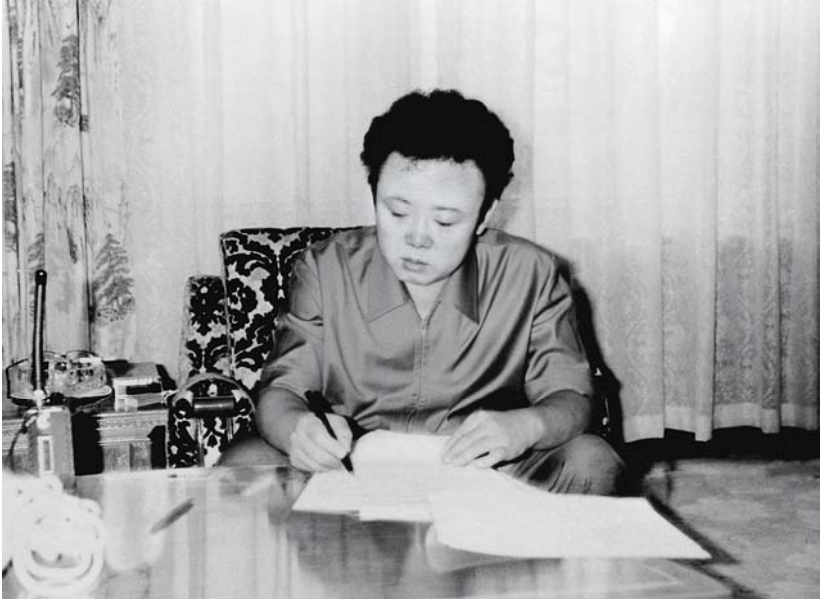
Kim Jong Il writing a treatise