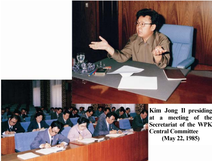
Kim Jong Il presiding at a meeting of the Secretariat of the WPK Central Committee (May 22, 1985)