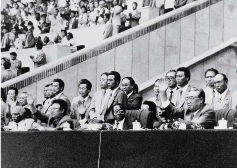
Kim Jong Il, in company with Kim Il Sung, at the opening ceremony of the 13 th WFYS (July 1, 1989)