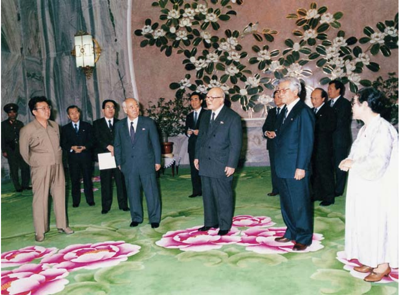
Kim Jong Il talking with officials of Chongryon (December 29, 1986)