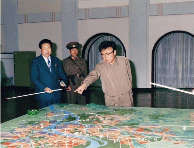
Kim Jong Il inspecting a construction model in Pyongyang (March 30, 1985)