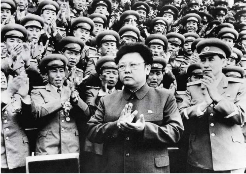
Kim Jong Il with People's Army soldiers