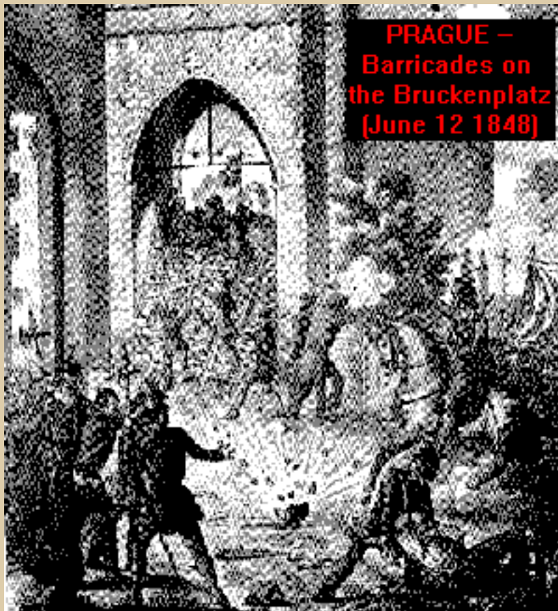
PRAGUE – Barricades on the Brückenplatz (June 12 1848)